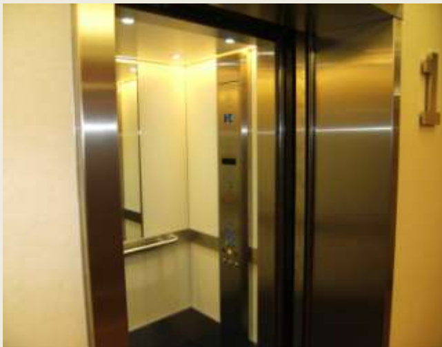
Low iron back painted glass car Including new car stations to DDA

Two lifts were completed at a time, by PIP Lift Service direct staff, the 20 week programme finished on scheduled date of 11th March 2011.