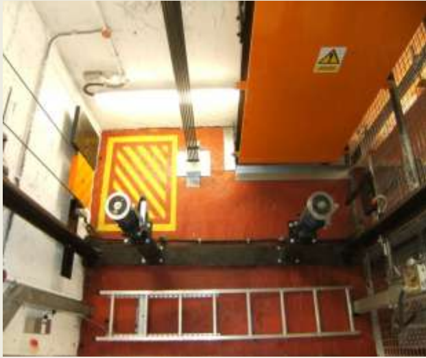
Painted lift shaft New pit equipment including hydraulic buffers and health & safety improvements