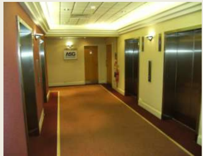
Satin stainless doors including landing architraves. DDA / US91 fixtures including dual illumination, LED indication and digital indicator displays.